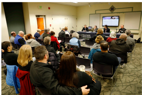
Pierce County Conversations